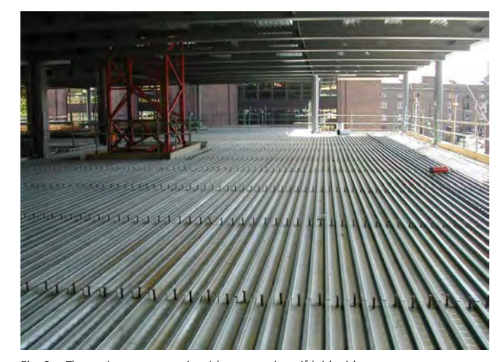
Fig. 3 • The entire cover area is without openings if laid with care.