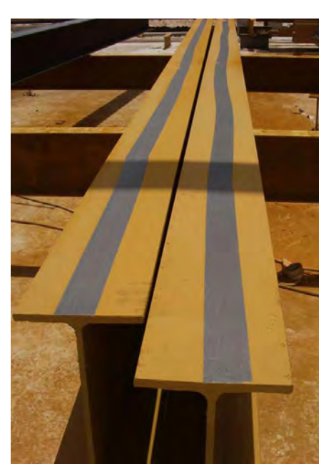
Fig. 7 • The taped area remains without coating.

tion, bend tests, macro section and radiographic testing, and in France surface crack testing (PT) after cutting off the stud as well, the main focus in the UK lay on building site conditions. According to the information supplied by the British members of the working group to establish the standard, the qualification there was invariably granted for only one specific project, because the profiled sheet, its zinc coating, the welding power source, the cable lengths, etc., were expected to be different in each case. Ten studs are welded, and these are subjected to a visual examination and a bend test (bending angle 30°) - but no macro section, no radiographic testing. Taking the necessary test samples for this purpose would actually be almost impossible. However, the production monitoring authority then stipulates a ring test on all studs in addition to the visual examination. This ring test, also regulated under the EN ISO 14555 standard, has occasionally triggered head shaking, but sometimes it is also prescribed for direct welds,