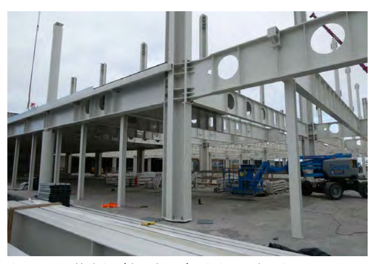
Fig. 12 • Favourable design of the node area for seismic stress absorption.