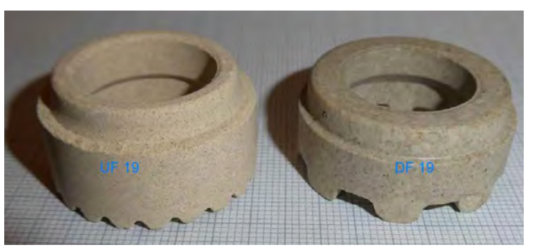
Fig. 11 \bullet Ceramic ferrule for direct welding on the left and for through-deck stud welding on the right.

In a study conducted by SLV Munich [2], it has been proved that it is basically possible to weld successfully through galvanized profiled sheets. Fig. 4 shows an example of a macro section and Fig. 5 a radiographic picture of a through-welded stud.