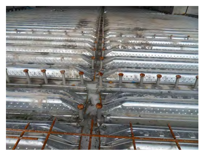
Fig. 2 • The openings of the profiled sheets have been closed by pressing them down.