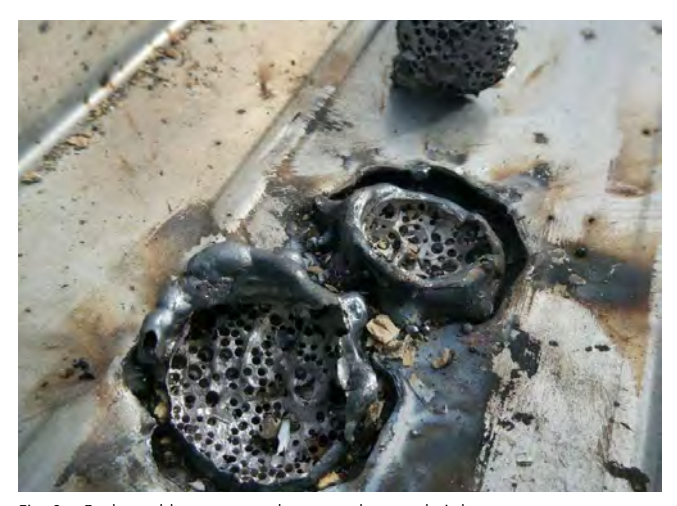
Fig. 9 • Faulty welds near a gap between sheet and girder.