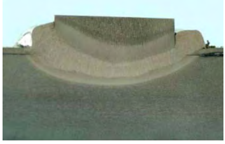
Fig. 4 • Faultless stud weld through galvanized sheet.

According to EN ISO 14555 [1], the qualification of the welding procedure specification (WPS) also includes welding through galvanized profiled sheets ("through deck stud welding technology"). When this standard was established under German leadership on the basis of a national predecessor standard (DIN 8563 T. 10), as a European standard to begin with, the aim was for it to replace conflicting national standards. In Germany, there were no specific regulations for through deck stud welding technology, so that possibly the new European standard EN ISO 14555 would not have been accepted in Britain, because it would have been inadequate to replace the national regulations in force there. In fact, the British qualification differed significantly from those in Germany and in France (where a national standard for stud welding also existed). While on the continent it was common practice to qualify a welding process just once at the executing company, which included visual examina-