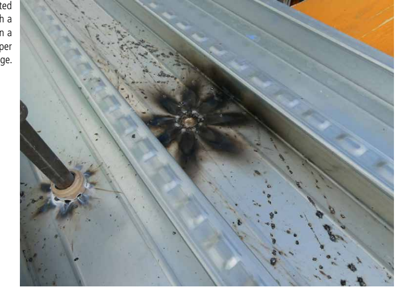
Fig. 6 • Attempted weld through a profiled sheet on a coated upper flange.

tion, bend tests, macro section and radiographic testing, and in France surface crack testing (PT) after cutting off the stud as well, the main focus in the UK lay on building site conditions. According to the information supplied by the British members of the working group to establish the standard, the qualification there was invariably granted for only one specific project, because the profiled sheet, its zinc coating, the welding power source, the cable lengths, etc., were expected to be different in each case. Ten studs are welded, and these are subjected to a visual examination and a bend test (bending angle 30°) - but no macro section, no radiographic testing. Taking the necessary test samples for this purpose would actually be almost impossible. However, the production monitoring authority then stipulates a ring test on all studs in addition to the visual examination. This ring test, also regulated under the EN ISO 14555 standard, has occasionally triggered head shaking, but sometimes it is also prescribed for direct welds,