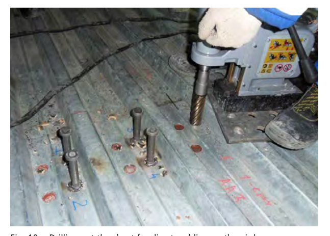
Fig. 10 • Drilling out the sheet for direct welding on the girder.

not "through deck stud welds", which, however, is not intended according to the standard. In ring tests, the welded studs are tapped with a hammer (please refer to the standard for details) with the effect of being slightly deformed. If the weld zone contains too many irregularities, the energy of the hammer blow is partly absorbed by internal cracking, thus producing a dull sound. If the sound is bright and clear, the weld zone is considered to be faultless. An important point: when the stud is tapped with too little energy, it will produce a clear sound with faulty welds, too. For this reason, the standard requires adequate experience on the part of the testing staff. This test method is also expressly designed for use only on buildings under predominantly static load.